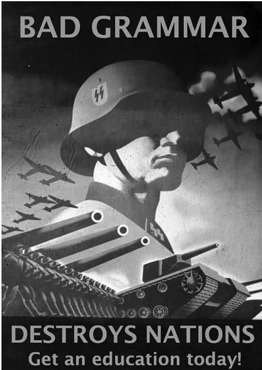
Figure 4.1 Bad grammar destroys nations

The idea of a standard language is constructed and re-constructed on an on-going basis by those who have a vested interest in the concept. At this juncture, it is necessary to consider in some detail exactly what this mythical beast called U.S. English is supposed to be.